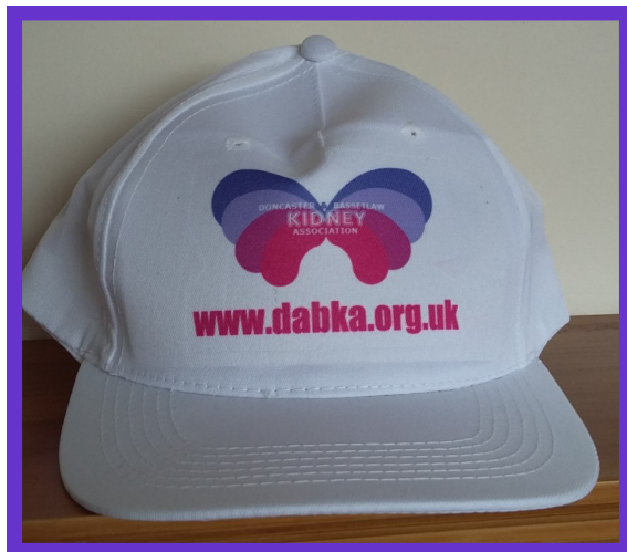
Baseball Cap £4.99