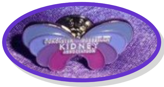
Pin Badge £1

We now have in stock a large selection of promotional items. If you would like to purchase any items, please contact us on 07444 281 141, email fundraising@dabka.org.uk or click on our on line shop at EBay.