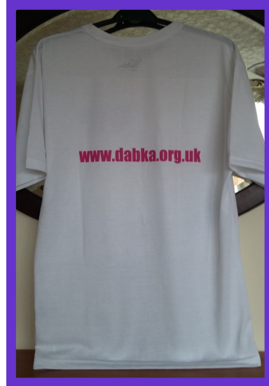
DaBKA T-shirt £7.99