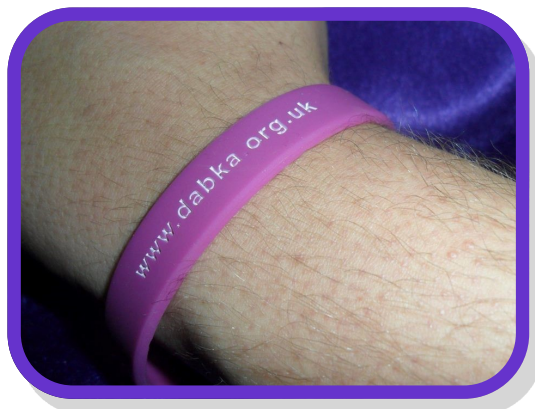
DaBKA wrist- band £1