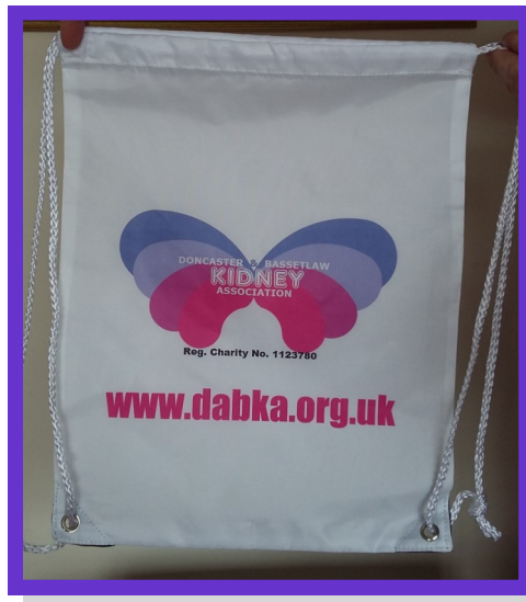
Sports Bag £4.99