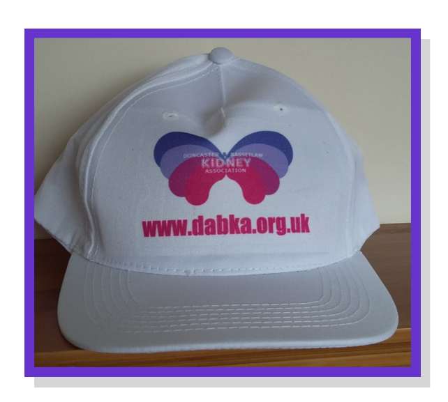
Baseball Cap £4.99