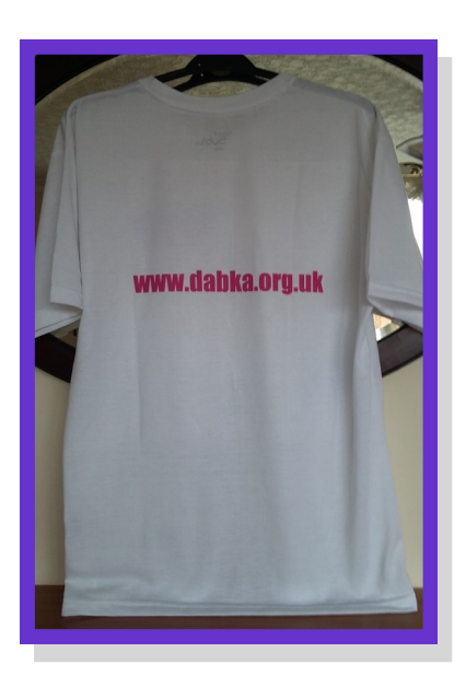
DaBKA T-shirt £7.99