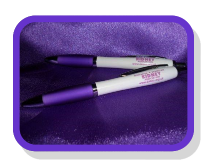
Our ever popular pens £1 for two pens