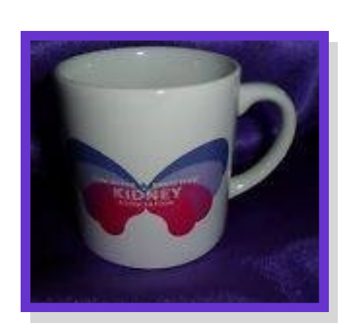
Mugs which hold 150ml £3.75