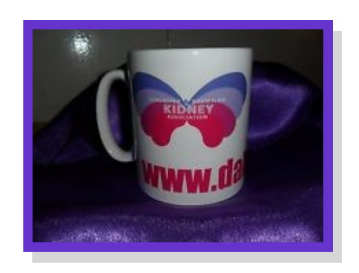
Mugs (logo) £4.99