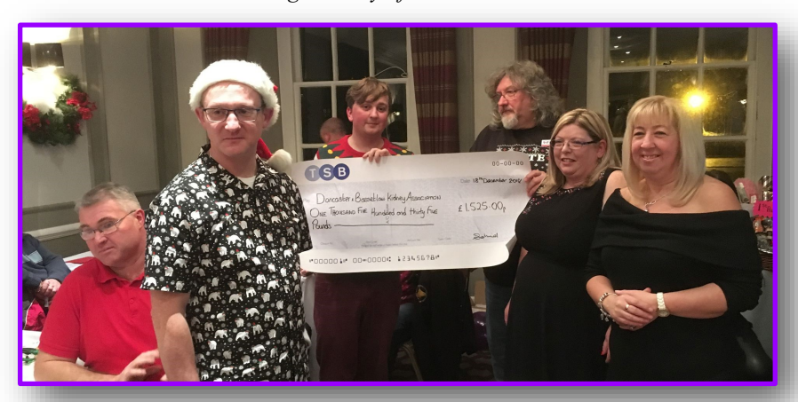
Pictured above: Staff from the renal ward presenting a Cheque to DaBKA from the renal ramble