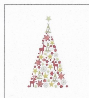
Tree of Symbols (Gold and Foil Highlights)