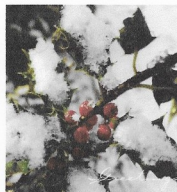
Red Berries [High Gloss Photo]