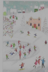
Skating in Snow (High Gloss Finish)