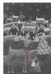
He's Here! (Coloured Foil Highlights)