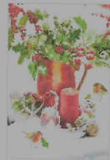
Winter Still Life (High Gloss Finish)