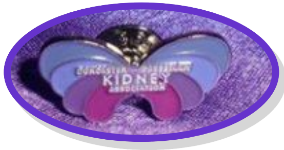
Pin Badge £1

We now have in stock a large selection of promotional items. If you would like to purchase any items, please contact us on 07444 281 141, email fundraising@dabka.org.uk or click on our on line shop at EBay.