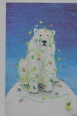
Northern Lights (High Gloss Finish)

Cards Measurements - 170mm x 115mm (6,5ins x 4.5ins)