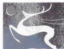
Deer on Blue

Square Cards Measure Approximately 160mm x 160mm (6.5 ins X 6.5 ins)