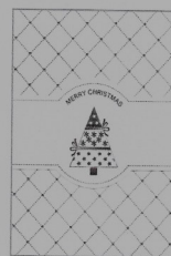
Quilted Tree Embossed with Gold and Red Foil Highlights