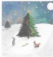
Christmas Animals [Embossed]