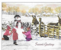
Donkeys in Snow