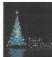
Christmas Sparkle [Gloss Finish]