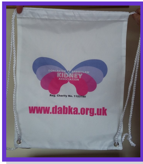
Sports Bag £4.99