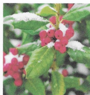
Holly Berries [High Gloss Photo]