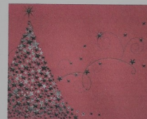
Tree os Stars (Silver and Gold Foil Highlights)