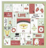
Christmas Advent Calendar [Gloss Finish]

DaBKA Christmas cards. The cards will be on sale in the renal units at Doncaster, Worksop & Mexborough