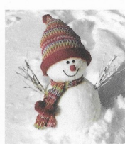
Snowman [High Gloss Photo]